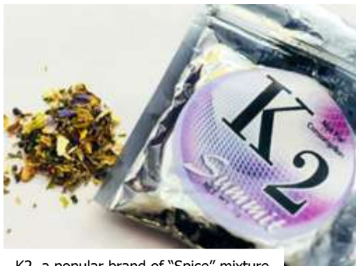
K2, a popular brand of “Spice” mixture

Some Spice products are sold as “incense,” but they more closely resemble potpourri. Like marijuana, Spice is abused mainly by smoking. Sometimes Spice is mixed with marijuana or is prepared as an herbal infusion for drinking.